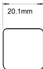
20.1 x 20.1 ( 22.5 Radius Corners)

Standard rectangular punch and die set ; NPPD 92 x 46 & NPPD 22.5 x 45. Non standard square and rectangular punch and die sets can be ordered, lead time for special die sets is generally 4-5 weeks.