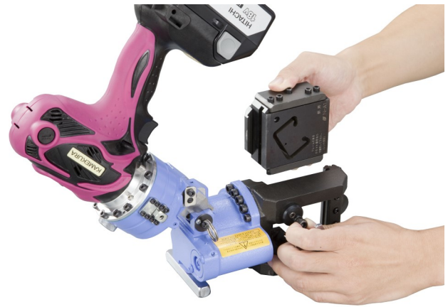
Single Strut Cutting Profile